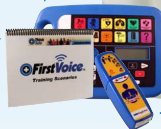
31" x 18" x 6" light-weight carrying case

The Training Scenarios Book (#TS001) can be used as needed for a quick anytime training refresher, bringing the instructor to you. Covers medical, injury, and environmental emergencies and ensures skills practice for CPR and a majority of workplace first aid incidences. Comes with quizzes and answer key for your workplace documentation records.