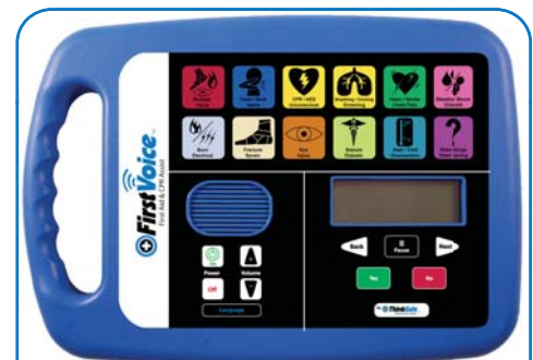
First Voice First Aid & CPR Assist (#CPRA01)

Endorsed by the American Lifeguard Association