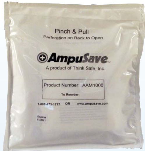
8.5" x 7.5" x 1" bag at 11 ounces

AmpuSave is a medical transport device that allows for proper storage and transport of severed digits and avulsions. AmpuSave consists of a storage compartment for a cold compress (which is included and sealed) and another storage compartment for gauze, saline solution, and an instruction card for proper preparation, as well as the necessary storage of the amputated digit or avulsion for transport. The included instruction card allows for recording the time of the injury and the injured party's name for accurate reporting of the incident.